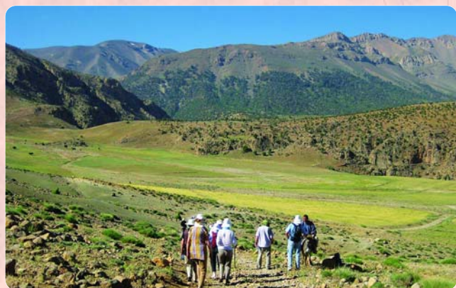
Walking in the Atlas Mountains

This morning we drive to the airport at Casablanca for the return flight to Perth.