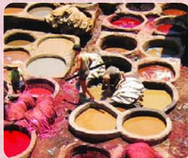
The old tanneries - Fes